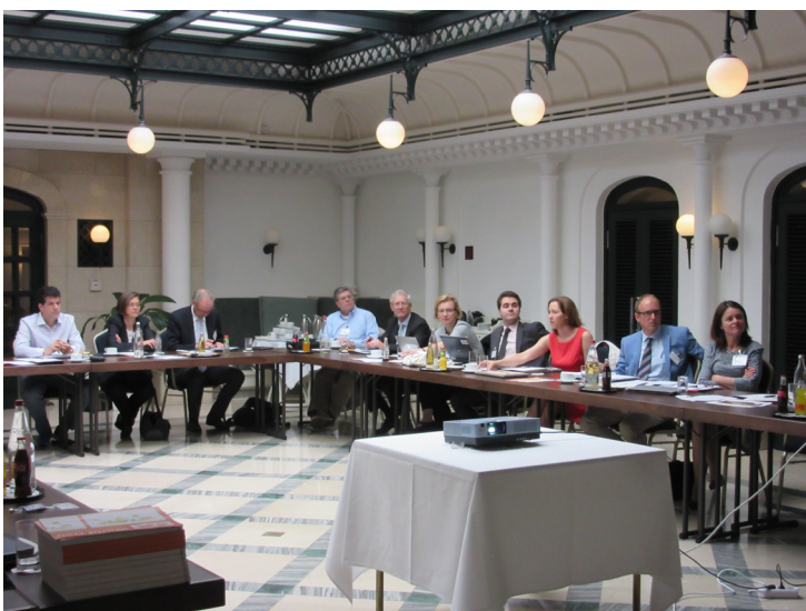
IDF Standing Committee on Dairy Policies and Economics spring meeting

The work conducted by the SC Marketing regarding Global Marketing Trends was presented for information, as it gives a vision of the current dairy product consumption trends. The participants noted the interest of such a study but suggested it should be completed by other country contributions.