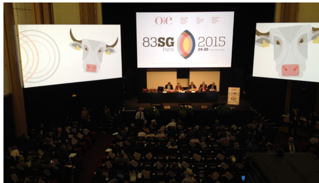
OIE83 General Session

Considering the tripartite agreement between FAO, OIE and WHO to address antimicrobial resistance (AMR) as a priority, the OIE 83SG adopted a resolution to develop a procedure and standards for annually collecting data from OIE member countries on the use of antimicrobial agents in food-producing animals.