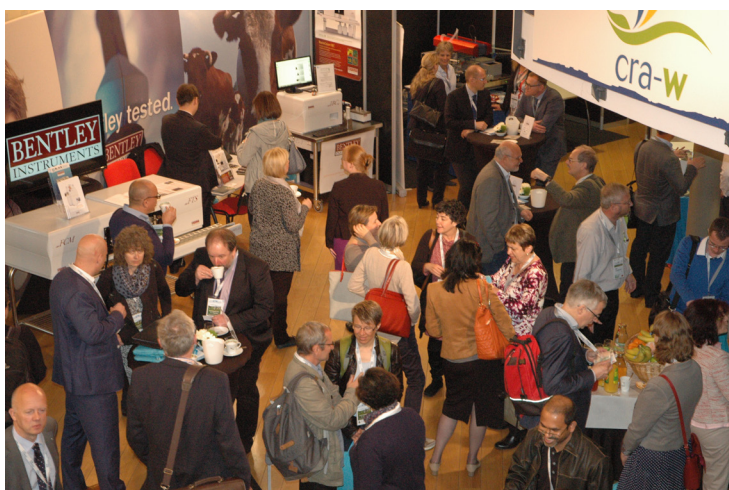
Participants exchanges with exhibitors at coffee break

"Altogether, nearly 220 of the top dairy scientists from all over the world were here for both the IDF/ISO Analytical Week and the OptiMIR Symposium. Feedback on the speakers, papers given and research findings has been excellent. Delegates were also able to enjoy the rich and varied cultural activities in