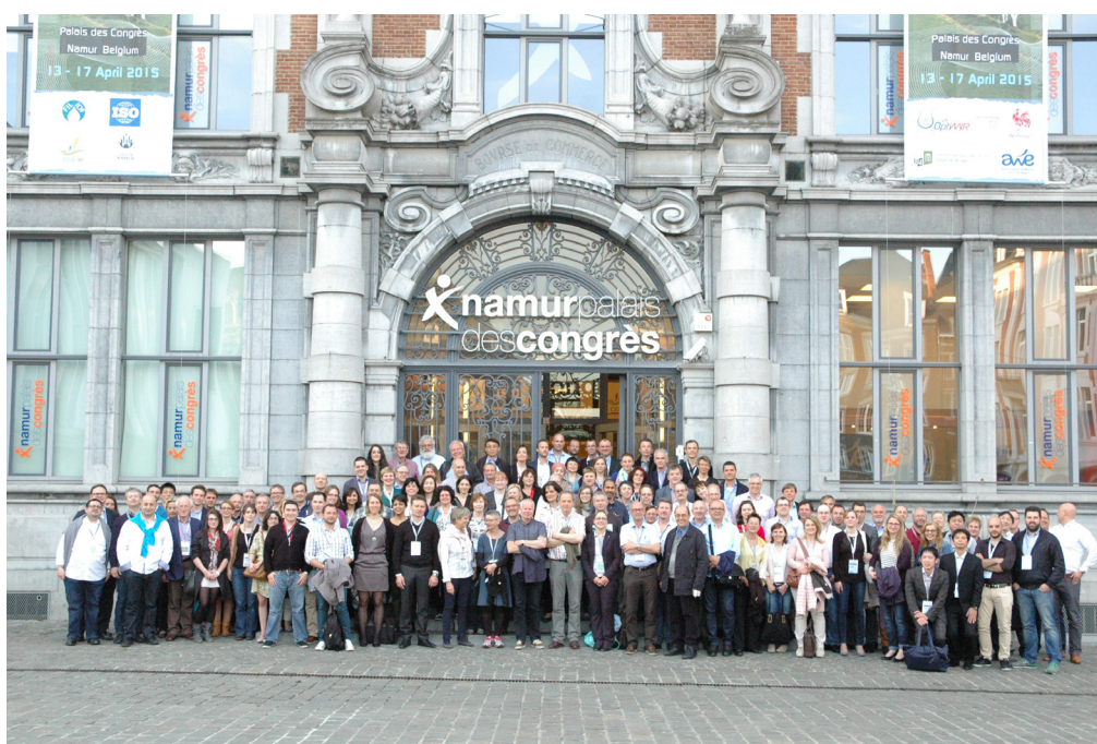
Participants of the the IDF/ISO Analytical Week 2015 in front of the venue – Palais des Congrès of Namur, Belgium