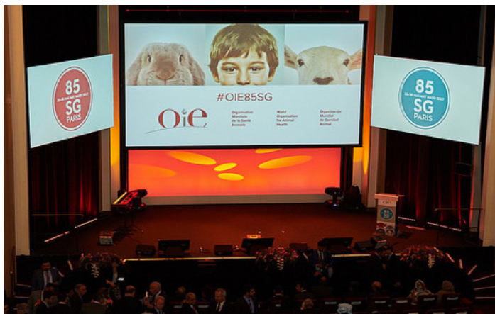
85th OIE General Session

After six days of consultation, 39 Resolutions were adopted by the OIE Delegates including new and amended international standards and guidelines aimed at protecting and improving animal health and welfare. Members of the IDF Standing Committee on Animal Health and Welfare provided science-based comments and proposals on several chapters. During the General Session, the chapter on infection with lumpy skin disease was updated and comprehensively revised to reflect the current disease outbreak situations and provide the appropriate risk management options. A new chapter on the prevention and control of Salmonella in bovine production systems was developed to provide guidance to reduce the burden of disease in these species, as well as the risk of human illness through foodborne contamination and direct or indirect contact with infected animals. A new chapter on infection with Mycobacterium tuberculosis was created by merging the two existing chapters on bovine tuberculosis and bovine tuberculosis of farmed cervidae into a single multispecies chapter aimed at managing the human and animal health risks from infection by M. tuberculosis . The General Session was also an opportunity to discuss the current animal health situation globally. Particular attention was paid to specific diseases, including peste des petits ruminants, foot and mouth disease and lumpy skin disease.