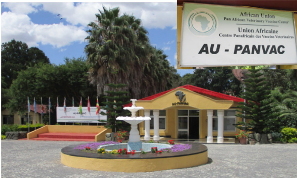
Slide prepared for the feedback from the NVI / AU-PANVAC visit.

What worked well: Veterinary vaccine production in Africa addresses both animal health and knowledge-generation needs in the continent